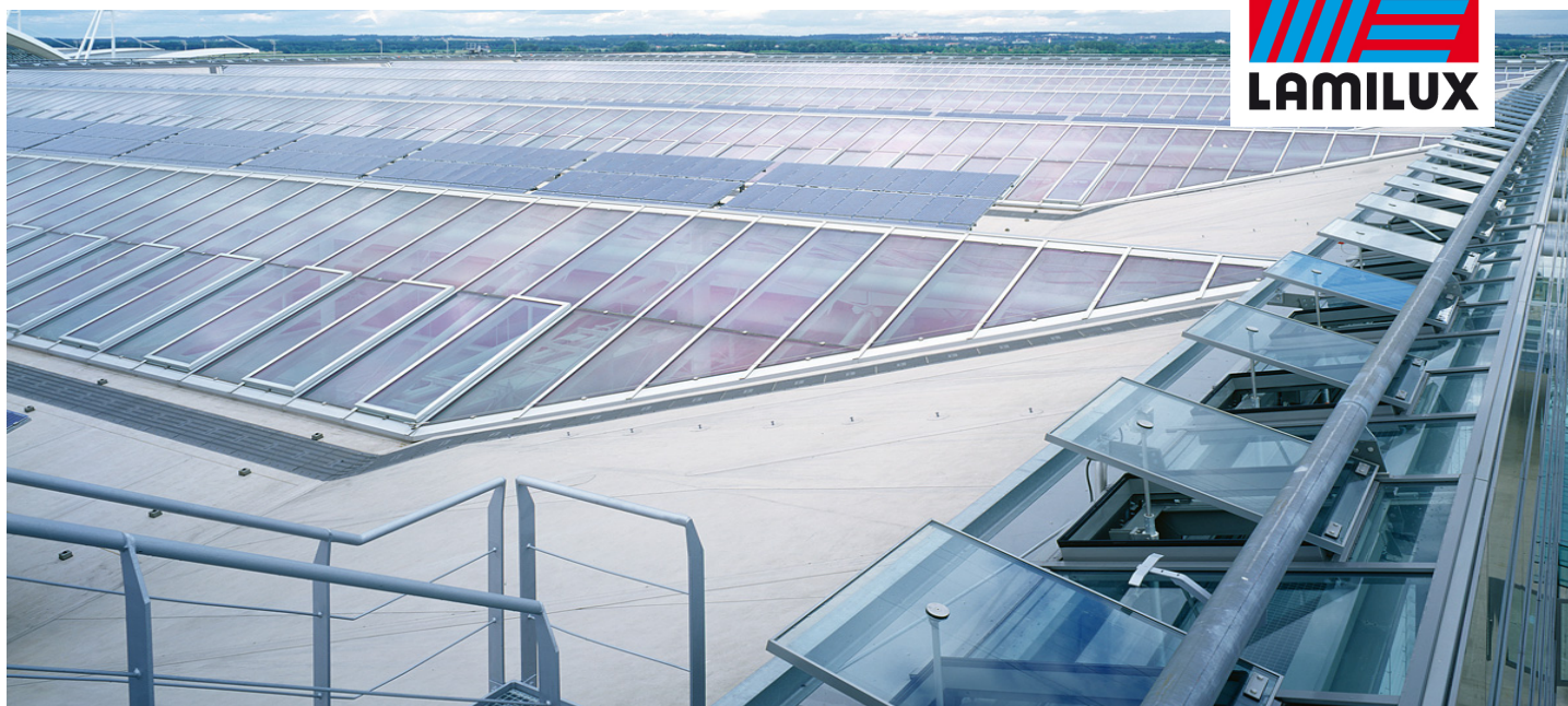
Terminal 2, Munich