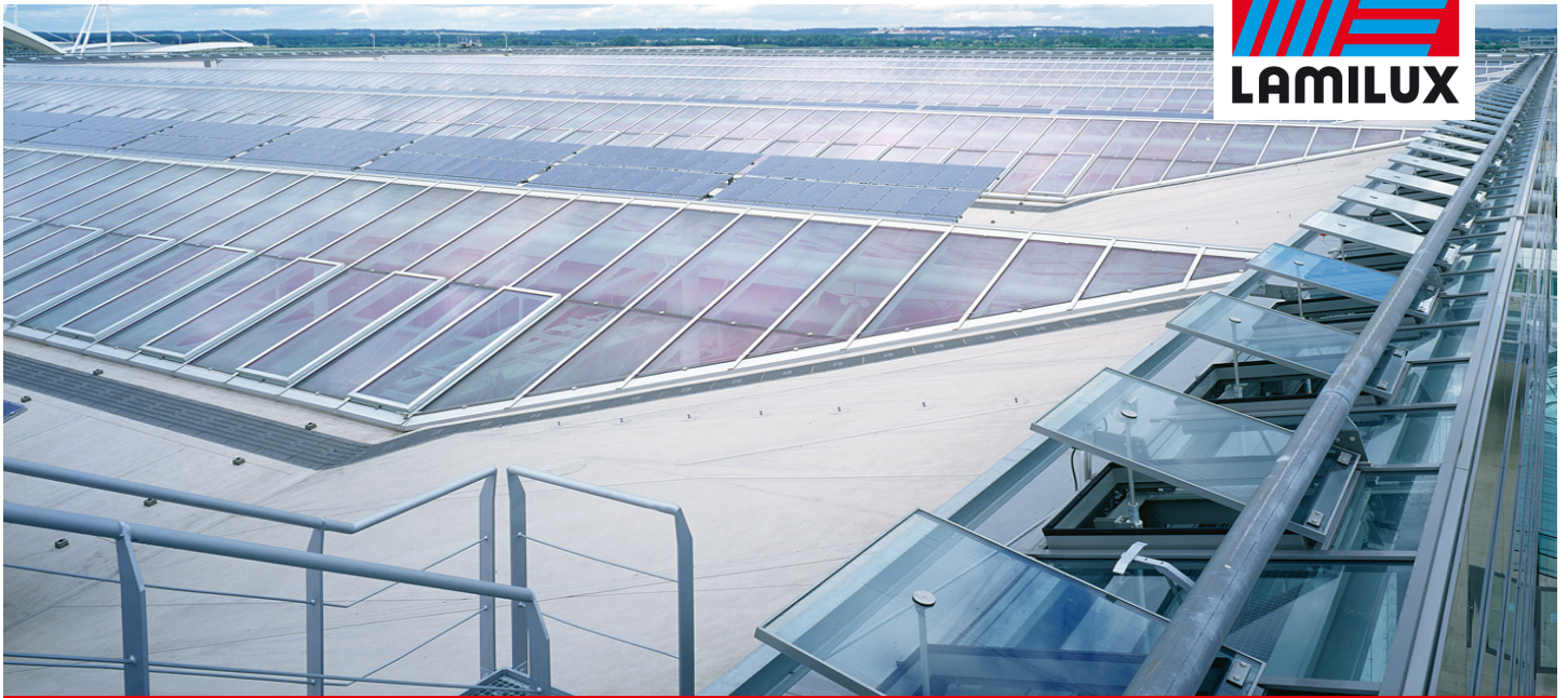
Terminal 2, Munich