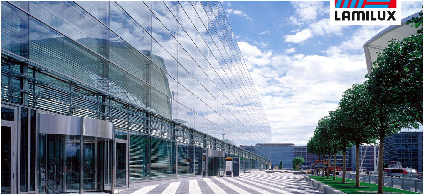
Terminal 2, Munich