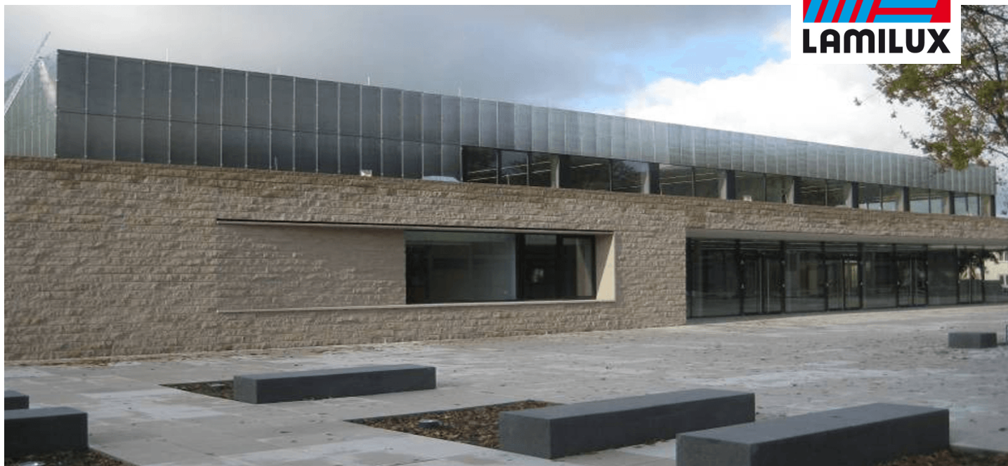
Multipurpose Hall Schillerhalle, Dettingen