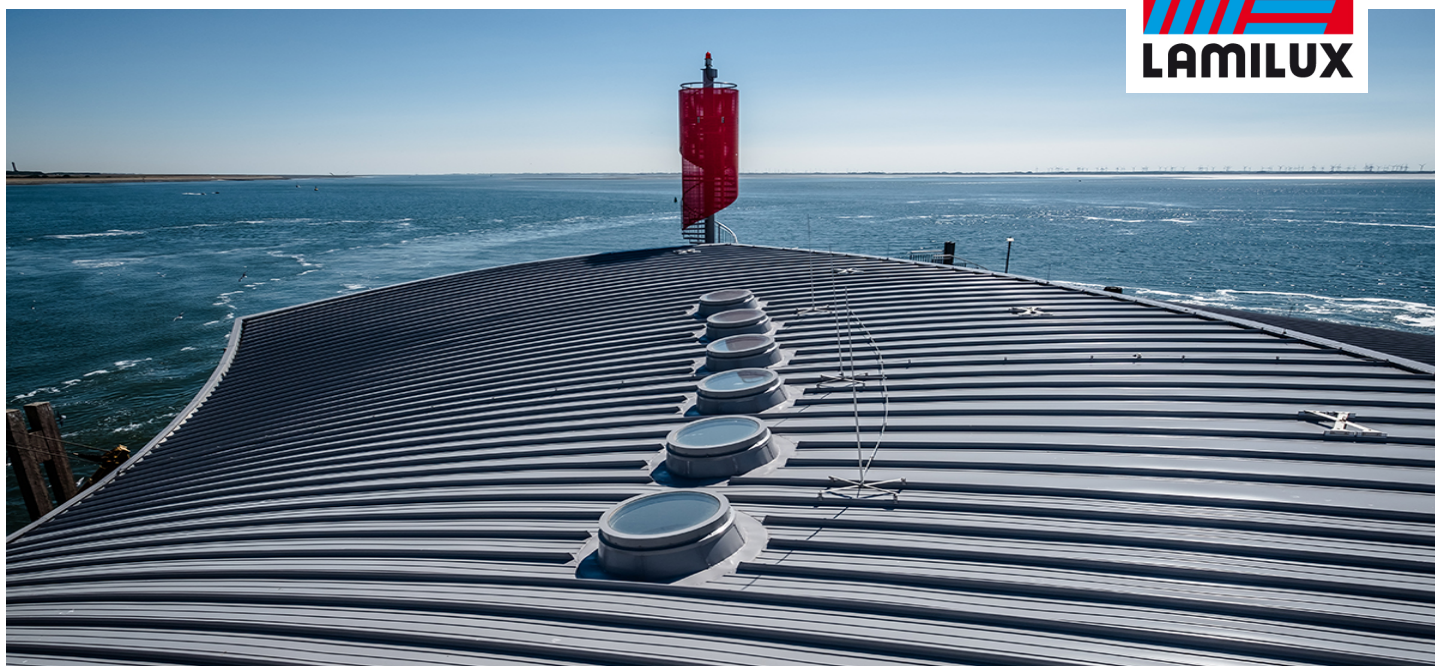
Harbour Terminal "Hafendüne", Norderney (Germany)