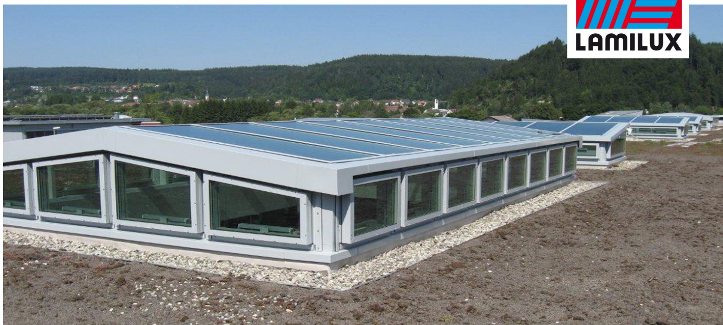
Administration Building, Tuttlingen