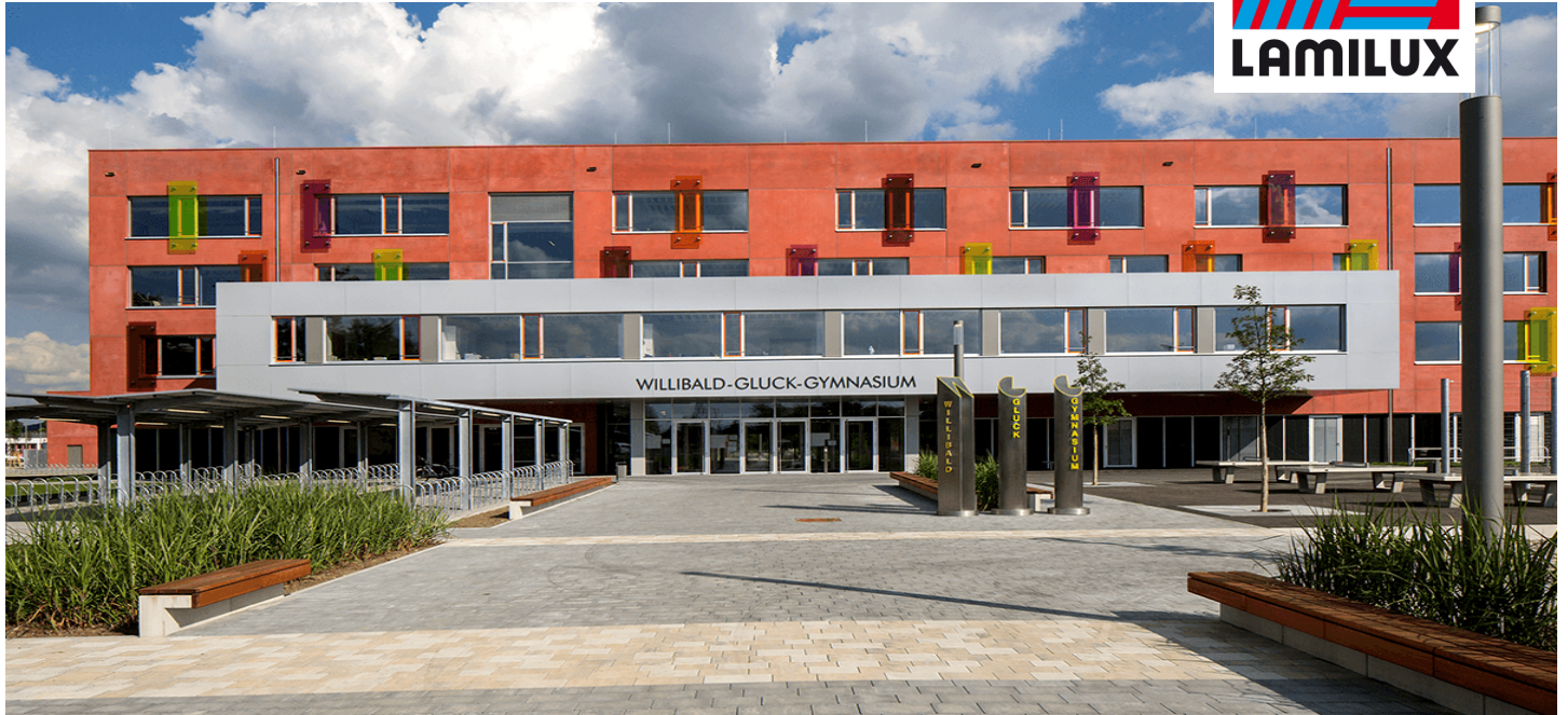
Willibald-Gluck Secondary School, Neumarkt i.d. OPf.