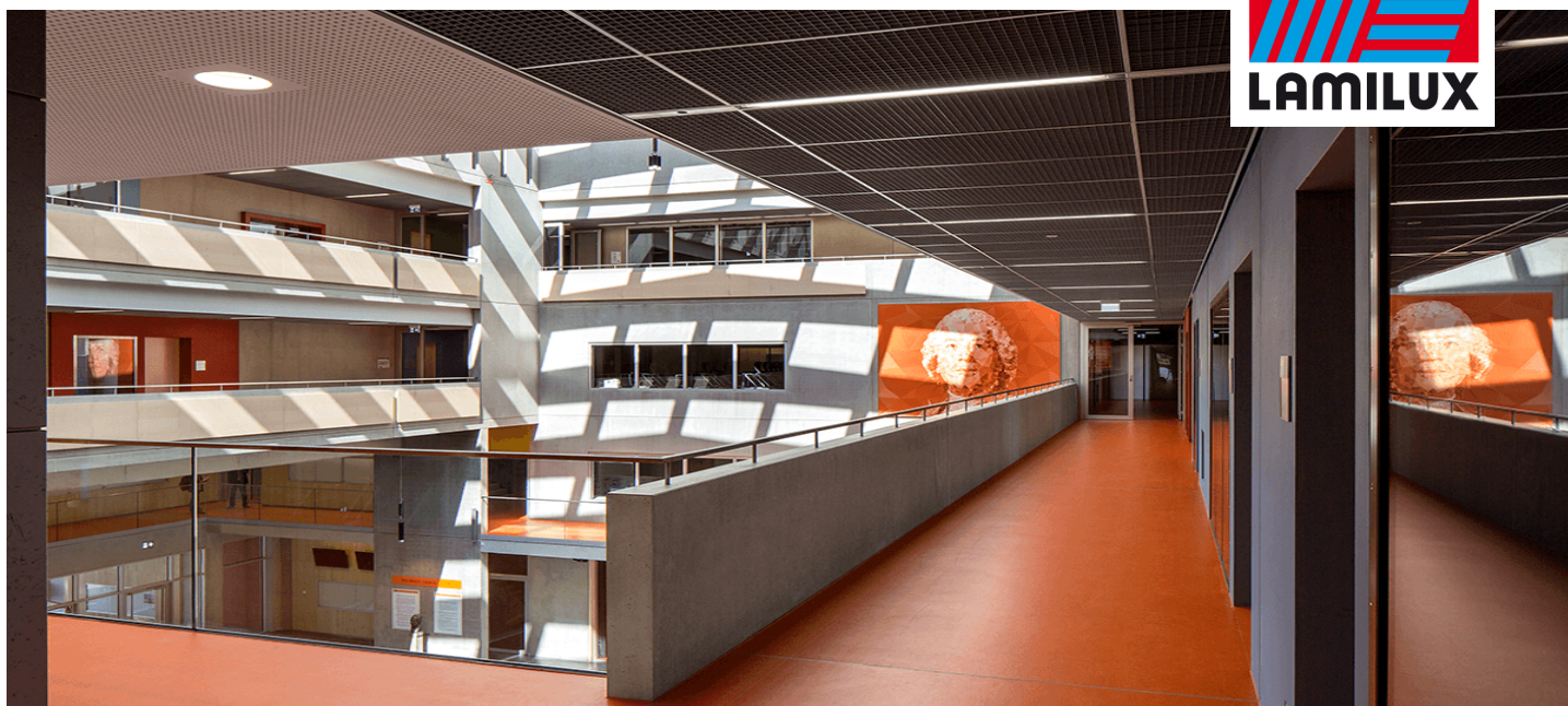
Willibald-Gluck Secondary School, Neumarkt i.d. OPf.