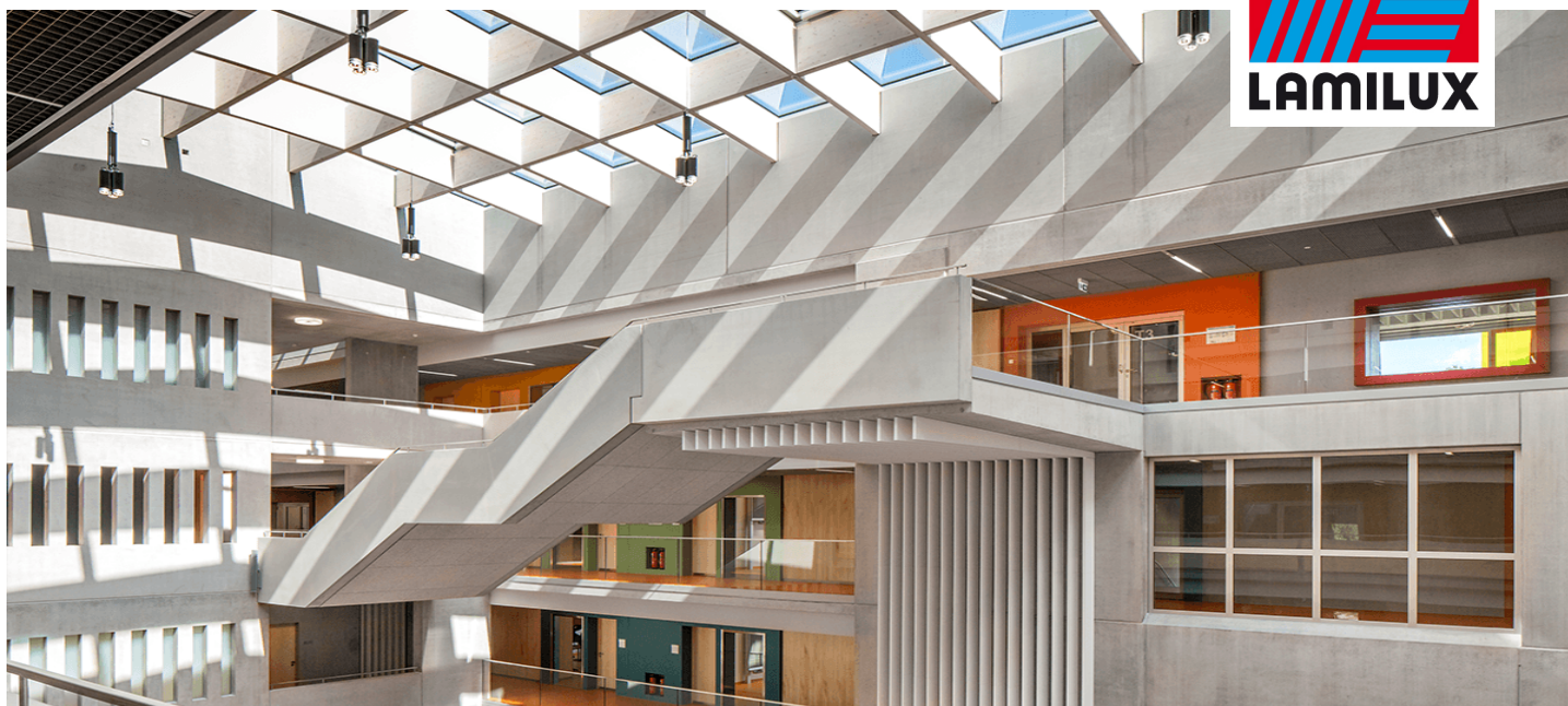
Willibald-Gluck Secondary School, Neumarkt i.d. OPf.