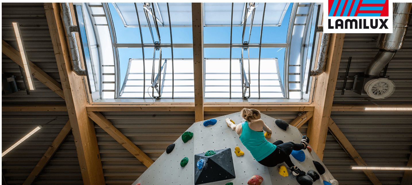
Climbing Centre OWL, Brakel